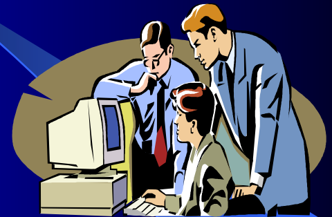
IT Consulting & Staffing